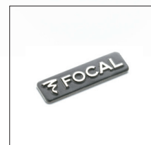
Focal logo (aluminium -diamond cutting)