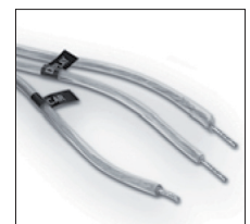
Assembly option : car and display