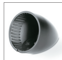
Tilted mounting Easy installation