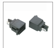
ISO connector (woofer)